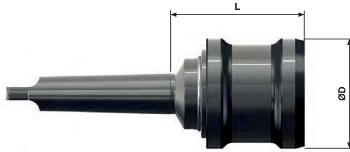
Quick-change chuck Jahrls